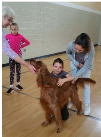
Prince, an Irish setter, gets some loving from a camper